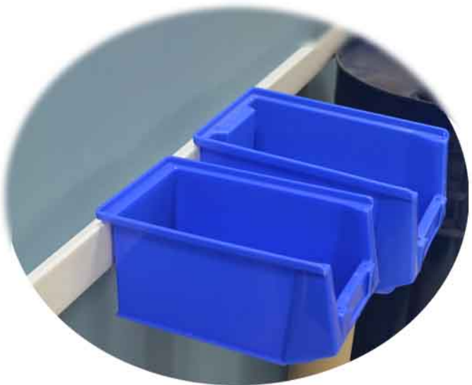
Provision for hanging

These baskets are ideal for storage and handling of tools, spare parts products machinery tools etc. These are complete closed crate suitable for stacking on each other.