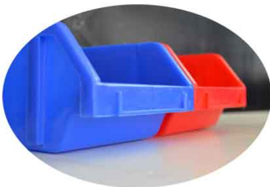
Name tag slot